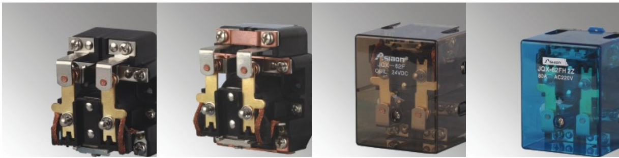
JQX-62 2Z 80A