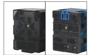
Screw mounting type