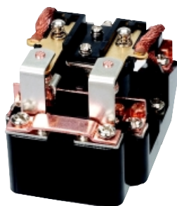
JQX-62F 2Z 80A