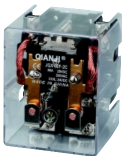
JQX-62F 2Z 80A