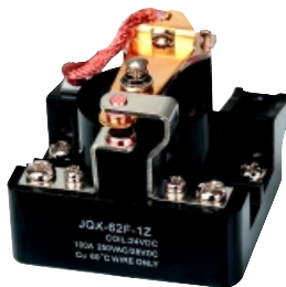
JQX-62F 1Z 100A