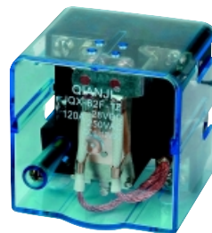
JQX-62F 1Z 120A