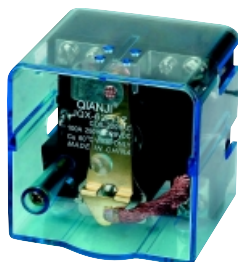
JQX-62F 1Z 100A